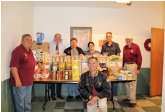
Our Council in Action: Food donation to the Deacon Jack Seymour Food Pantry