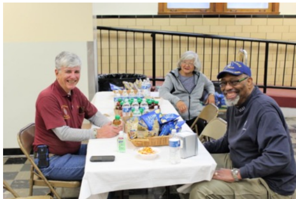
The first annual Knights of Columbus, Council 444, American Red Cross blood drive.